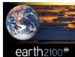
Earth 2100: Play the Game and Participate!