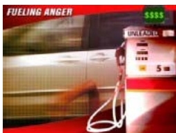
Special Section: Fueling Anger