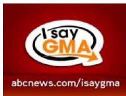
Send Us Your Video: How Do You Say GMA?