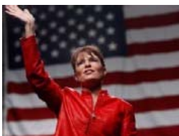
The Note: Palin a Drag in Final Stretch